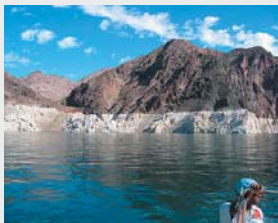
Colorado River reservoir

Pump stoppages in Northern California and dwindling supplies due to drought on the Colorado River make it imperative for all to conserve.