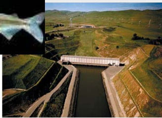
In June 2007, the Harvey O. Banks pumping plant shut down temporarily to protect Delta Smelt.

The water imported approximately 400 miles east from the Colorado River has been plagued with an eight-year drought. To compensate for the critical losses there,